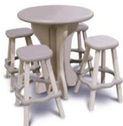
Confer Plastics Bistro Set