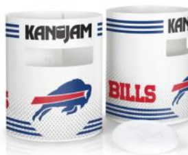
Buffalo Bills Kan Jam Set