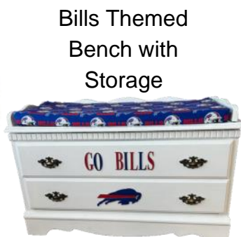
Bills Themed Bench with Storage