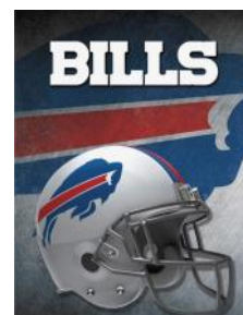
Framed Buffalo Bills Diamond Art