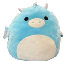
24 inch Dragon Squishmallow